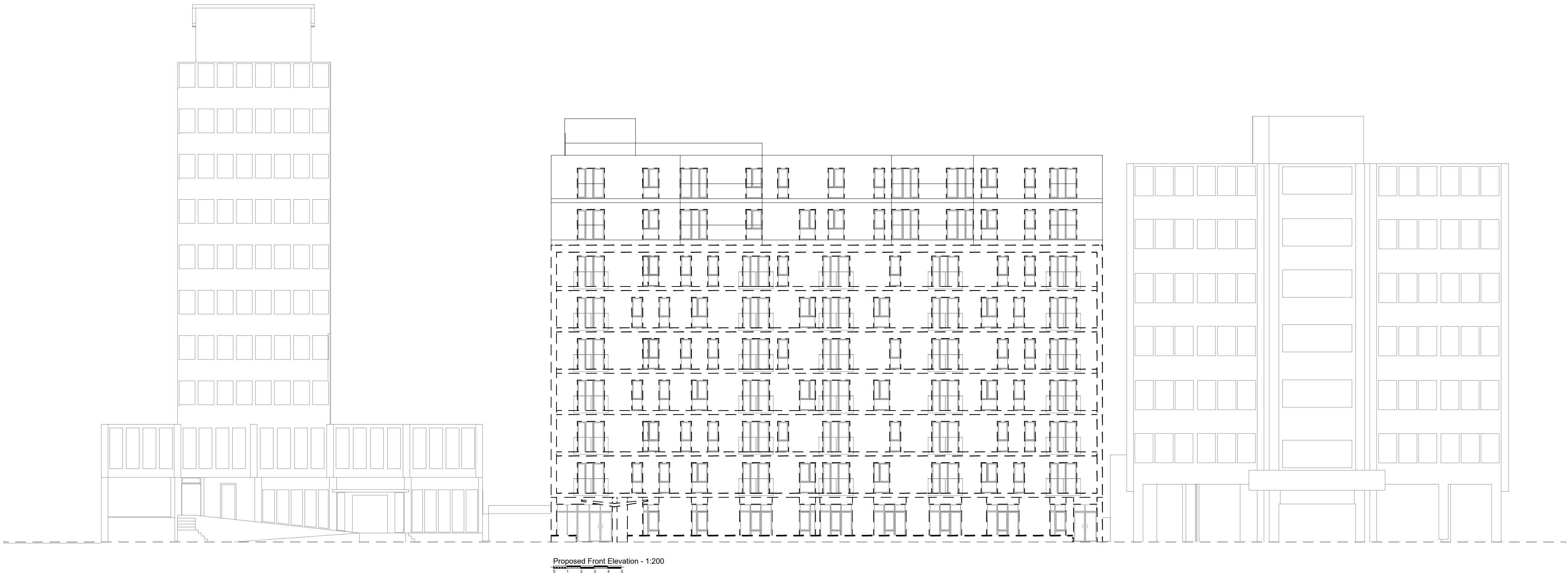
Proposed Front Elevation - 1:200